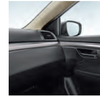
Satin Finish Ornament