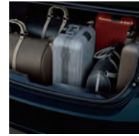
Ample Boot Space