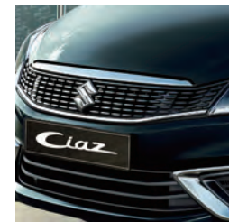
Chrome Front Grille

When you move up in life, you enjoy better and more refined experiences. And that is what you get with the new Ciaz. The moment it makes its appearance, the new Ciaz creates an instant impression with its stunning revamped exterior. The new LED Headlamps and DRLs combined with the stylish new Front Grille show that there's room for more, even in perfection. So, drive the new Ciaz and experience life on a whole new level.