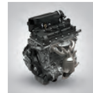
1.5L Petrol Engine