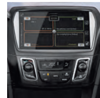
Smartphone Linkage Display Audio

Once you step inside the new Ciaz, you might never want to step out. And we don't blame you. The new Ciaz offers everything you need, and more, making it a complete sedan. Plush interior along with Illuminated Meter Display, and Car Audio with Bluetooth, make Ciaz a drive like no other.