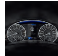
Meter Cluster Illumination