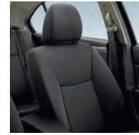
Sleek Leather Seats