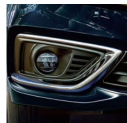
LED Fog Lamps with Chrome Accent