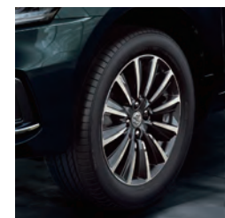
16-inch Alloy Polished Wheels