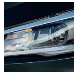
LED Projector Headlamps with DRL